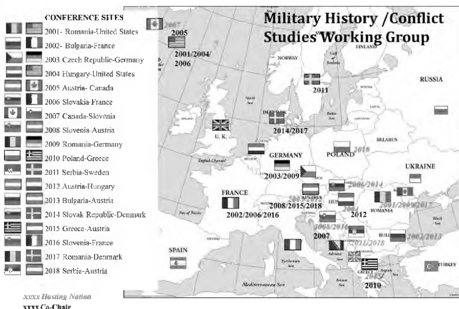
Figure 2. Seminar Sites