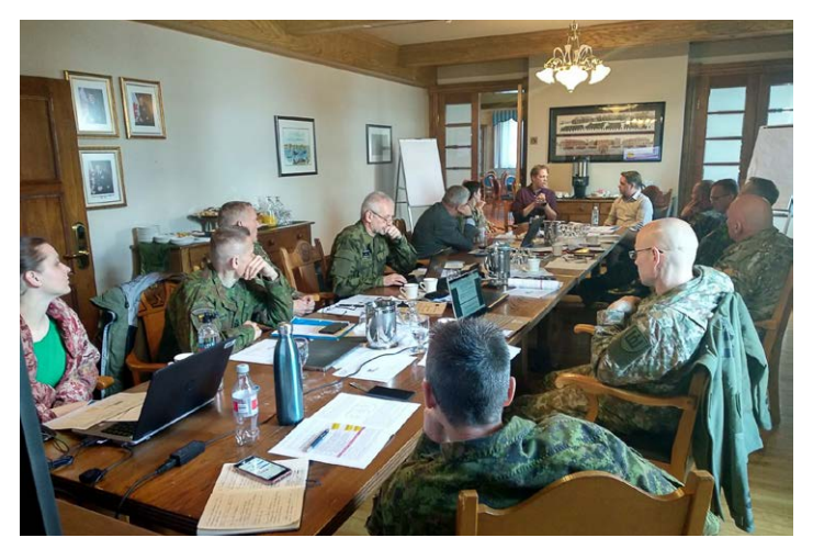
NCO Corps PD Reference Guidance Project Team Meeting, Saint-Jean-sur-Richelieu, Canada, May 2019