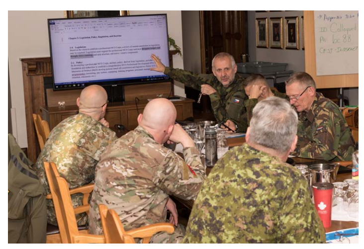
NCO Corps PD Reference Guidance Project Team Meeting, Saint-Jean-sur-Richelieu, Canada, May 2019

This document serves as a guide that complements the NCO Professional Military Education (PME) Reference Curriculum (RC). The NCO PME RC focuses exclusively on the structure and content of NCO courses. The NCO Corps Professional Development Reference Guidance is designed to help nations and Defence Education Enhancement Programme (DEEP) expert teams identify areas that are necessary to develop a professional NCO Corps but lie beyond the immediate scope of education. Building a solid foundation with critical milestones for personnel will lead to a professional, empowered, educated, and motivated NCO Corps. To that end, nations are encouraged to use this guide to identify necessary components to develop a professional NCO Corps and pinpoint challenges that cause stagnation in NCO educational development.