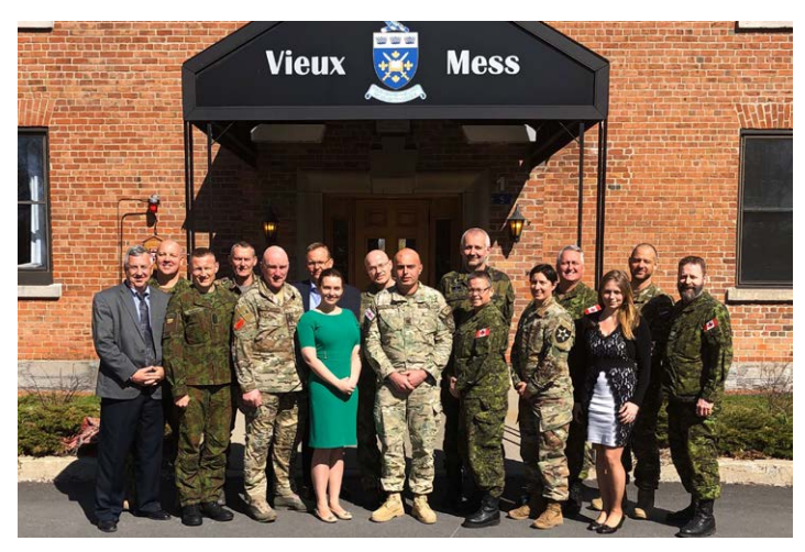
NCO Corps PD Reference Guidance Project Team Meeting, Saint-Jean-sur-Richelieu, Canada, May 2019