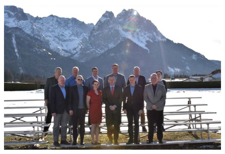
NCO Corps PD Reference Guidance Project Team Meeting, Garmisch-Partenkirchen, Germany, February 2019

about what programs to continue, alter, increase resources, cancel, etc. Internal evaluations and external validations are necessary to ensure learning objectives and outcomes are achieved based on curricula and operational requirements.