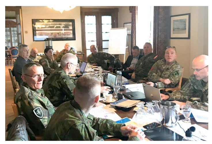
NCO Corps PD Reference Guidance Project Team Meeting, Saint-Jean-sur-Richelieu, Canada, May 2019

NCO Support Channels executes established policies, directives and orders, standardizes performance, executes and provides guidance on training and education ensures professional behavior and conduct of forces. The NCO Support Channel enforces established policies, executes directives and orders, enforces standards and performance, provides guidance on training and education, and promotes professional behavior and conduct. Additionally, NCO Support Channels must understand the Commander's Intent in order to be able to issue effective implementing instructions throughout the forces.