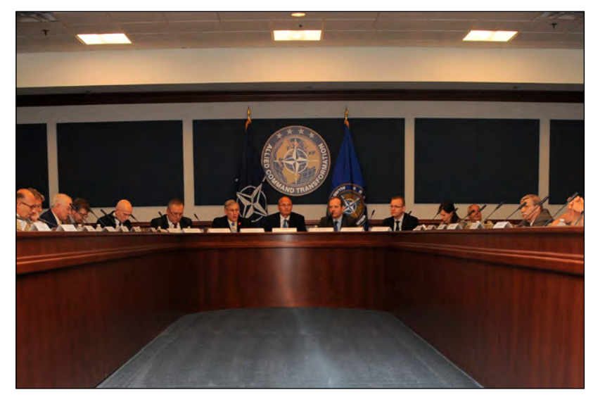
The 2<sup>nd</sup> functional Clearing-House meeting on Defence Education, Allied Command Transformation (ACT), Norfolk.