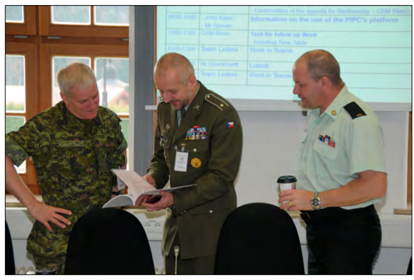
NCO PME RC Writing Teams' Workshop in Garmisch-Partenkirchen (contributors from Canada and the Czech Republic).

Leadership in the Canadian Forces: Leading People. Kingston, ON: Canadian Defence Academy, 2007.