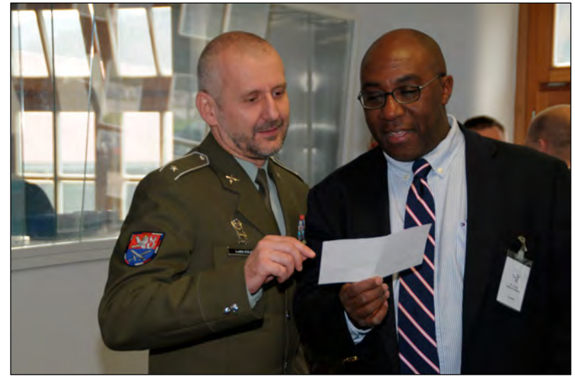
The Canadian Academic Lead discussing ideas with the Czech Peer Reviewer during the NCO PME RC Writing Teams' Workshop in Garmisch-Partenkirchen.