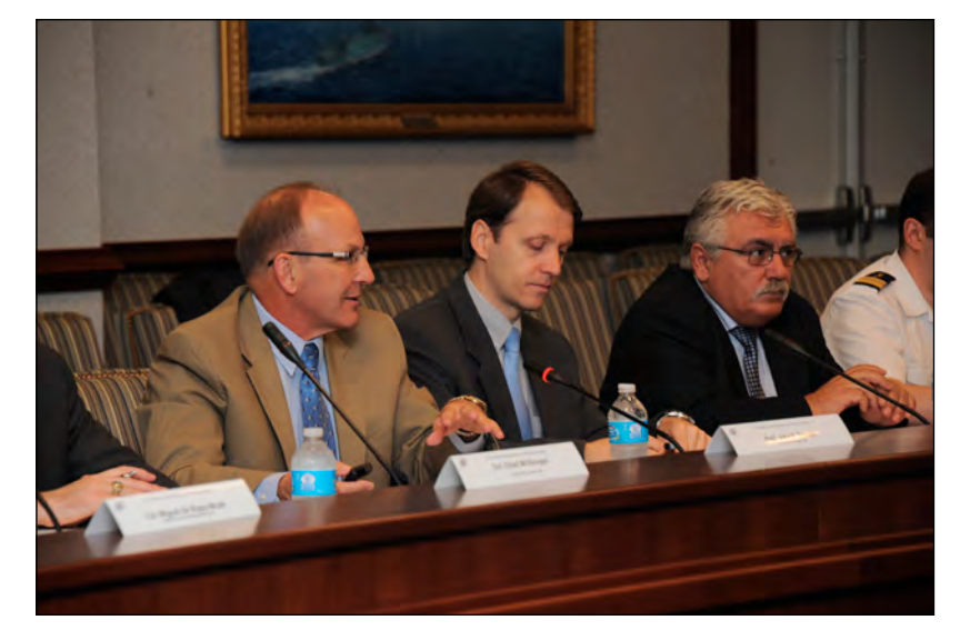
The 2<sup>nd</sup> functional Clearing-House meeting on Defence Education, Allied Command Transformation (ACT), Norfolk

Subject matter experts (SMEs) will work with host country to select appropriate readings.