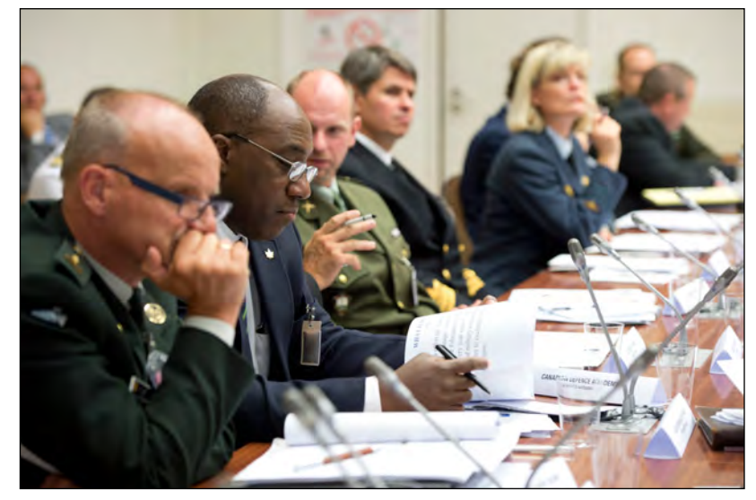
The 1st functional Clearing-House meeting on Defence Education, NATO HQ Brussels.

"The Young Officer and the NCO - The Regimental Rogue", a series of quotations on the NCO-officer relationship. http://regimentalrogue.com/srsub/officer_and_ nco.htm