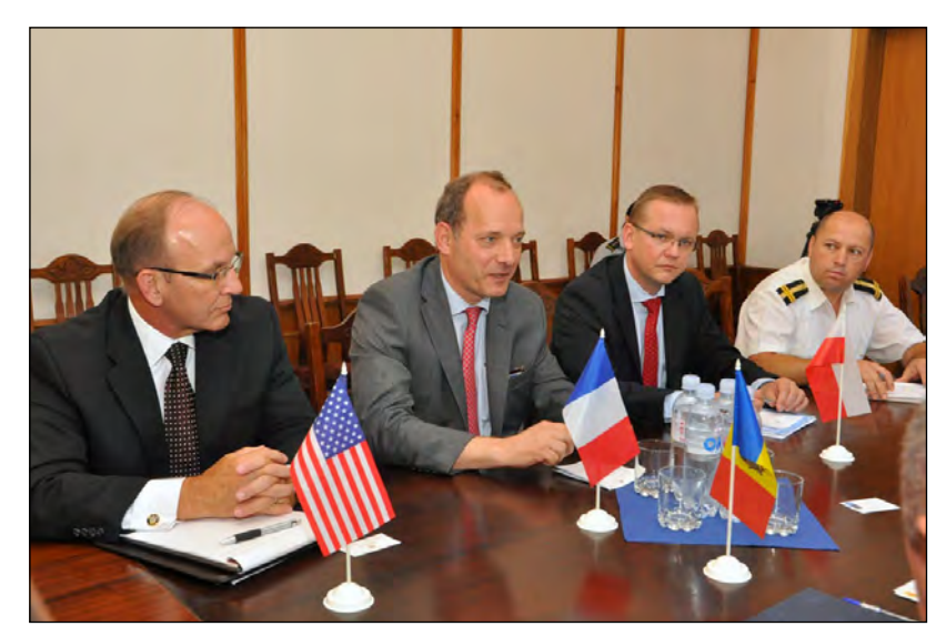
Defence Education and Enhancement Programme (DEEP) Review with the Moldovan Ministry of Defence.