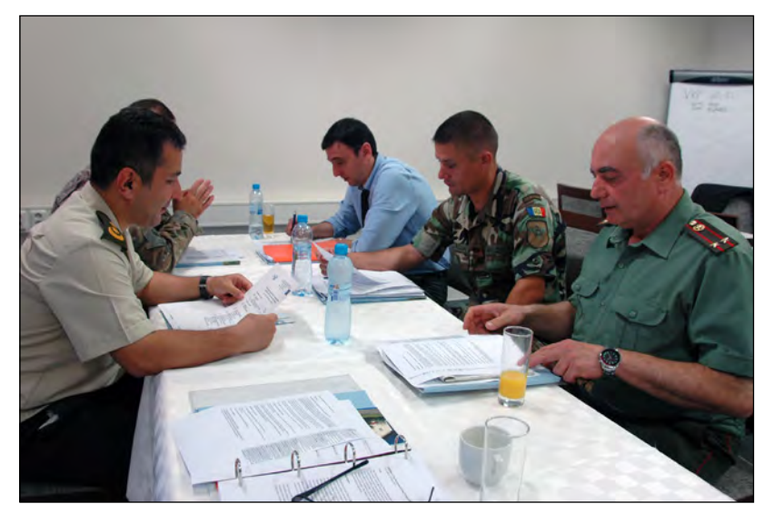
NCO PME RC final Plenary meeting in Prague including contributors from Armenia, Azerbaijan, Republic of Moldova.