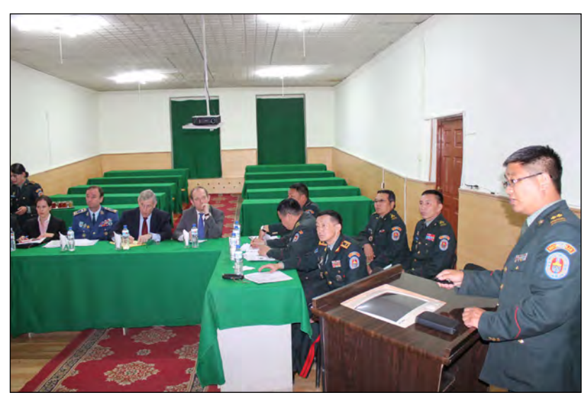
Defence Education and Enhancement Prog to Mongolia.