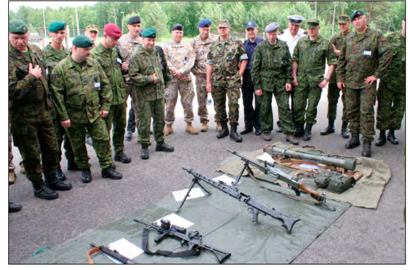
Participants of the Baltic States Senior NCO Seminar visiting an Estonian Army unit.