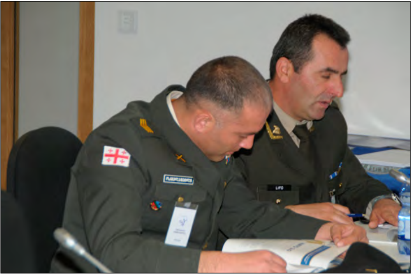
NCO PME RC Writing Teams' Workshop in Garmisch-Partenkirchen (contributors from Georgia and the Republic of Moldova).