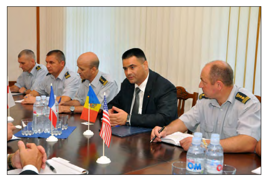
The Moldovan Minister of Defence discussing the DEEP Review with the Expert Team in Chisinau.