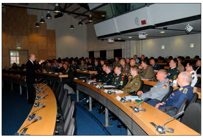
Director of the George C. Marshall European Center for Security Studies addresses participants of the International Senior Enlisted Seminar in Garmisch-Partenkirchen, 2008.

Headquarters, Department of the Army. Field Manual 3-21.8, The Infantry Rifle Platoon and Squad . Washington, D.C.: Training and Doctrine Command, 2007.