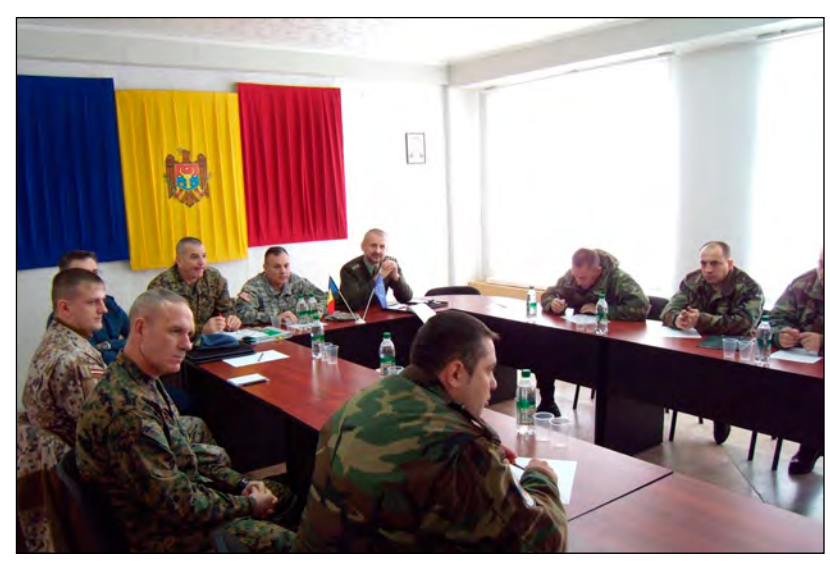
Meeting of the DEEP Expert Team (ACO, ACT, Canada, Latvia, US) with Moldovan NCOs.