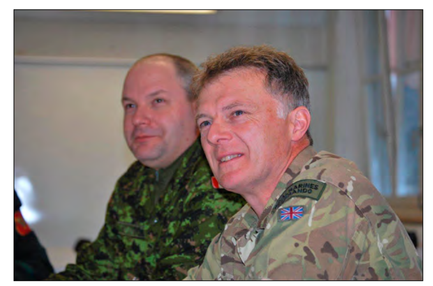
NCO PME RC Writing Teams' Workshop in Lucerne (contributors from ACT and Canada).

U.S. Army, Training Circular 3.21-20, Army Physical Readiness Training. Washington DC: March 2010.