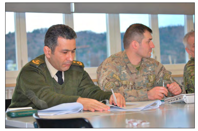
NCO PME RC Writing Teams' Workshop in Lucerne (contributors from Azerbaijan and Georgia).

Not instructed at this level. Material at the Intermediate Level is sufficient.