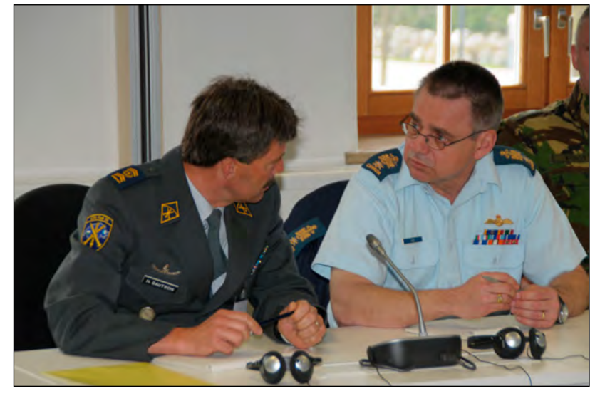
NCO PME RC Writing Team Leads (Switzerland and Canada) consulting during the workshop in Garmisch-Partenkirchen.

Applicable national readings on ethos and values will be selected by recognised subject matter experts.