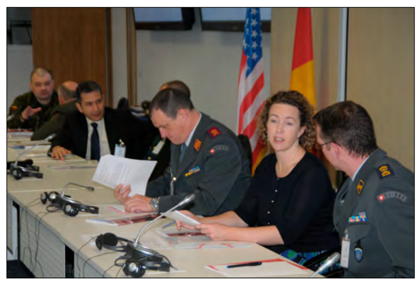
Centre for the Democratic Control of Armed Forces (DCAF) representative streamlining UN Security Council Resolution 1325 on Women, Peace and Security into the Curriculum.