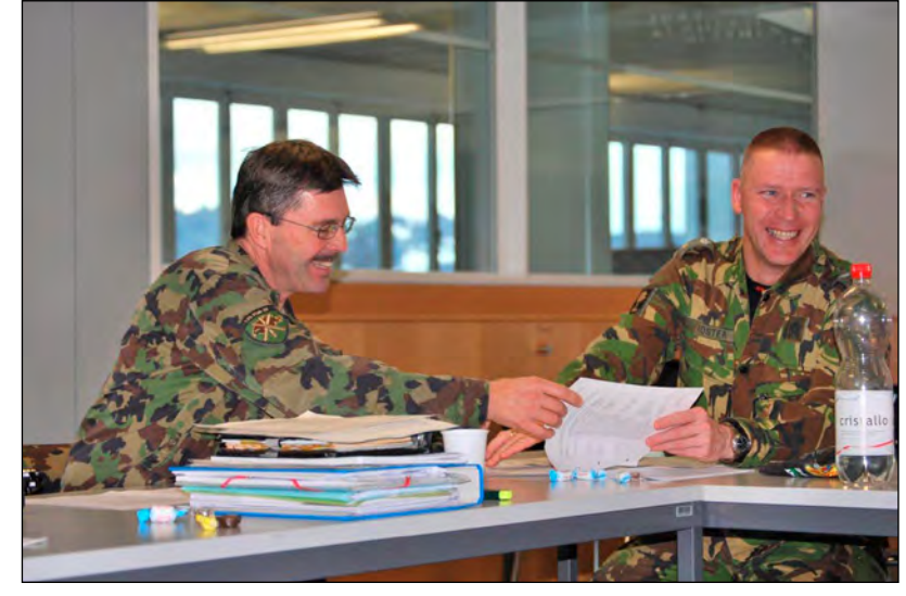
NCO PME RC Writing Teams' Workshop in Lucerne (contributors from the Netherlands and Switzerland)

Applicable national guidance on ethos and values should be provided by national experts.