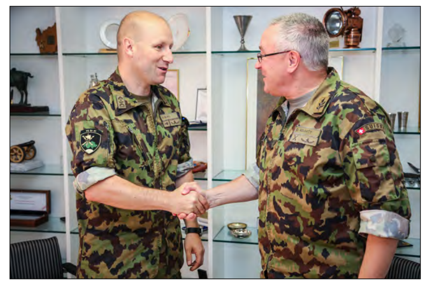
The Commandant of the Swiss Armed Forces College thanking the Project Manager for the excellent work.