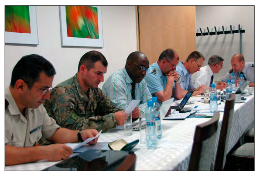
NCO PME RC final Plenary meeting in Prague including contributors from Azerbaijan, Canada, Georgia, NATO, PfPC and Switzerland.