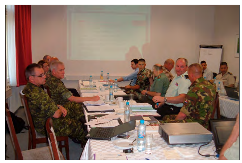
Work in progress during the NCO PME RC final Plenary meeting in Prague