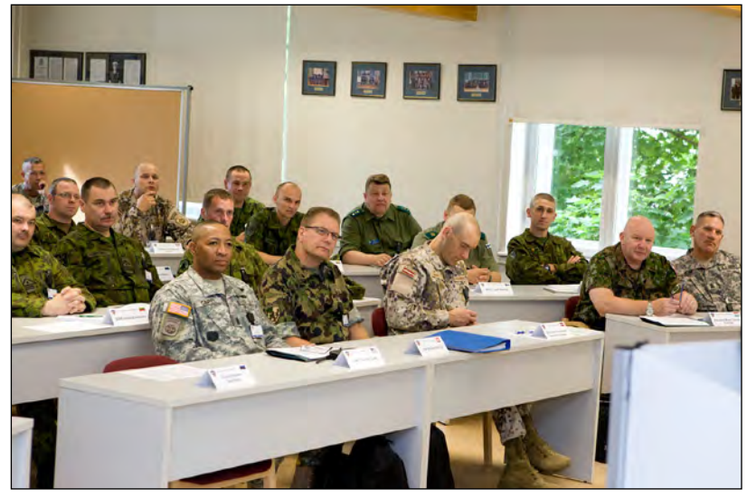
Baltic States Senior NCO Seminar.