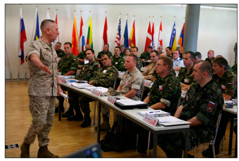
Senior NCO Leadership Course in Lucerne, 2008.