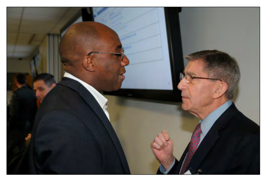
The Canadian Academic Lead with the PfP Consortium representative at the Workshop in Garmisch-Partenkirchen.