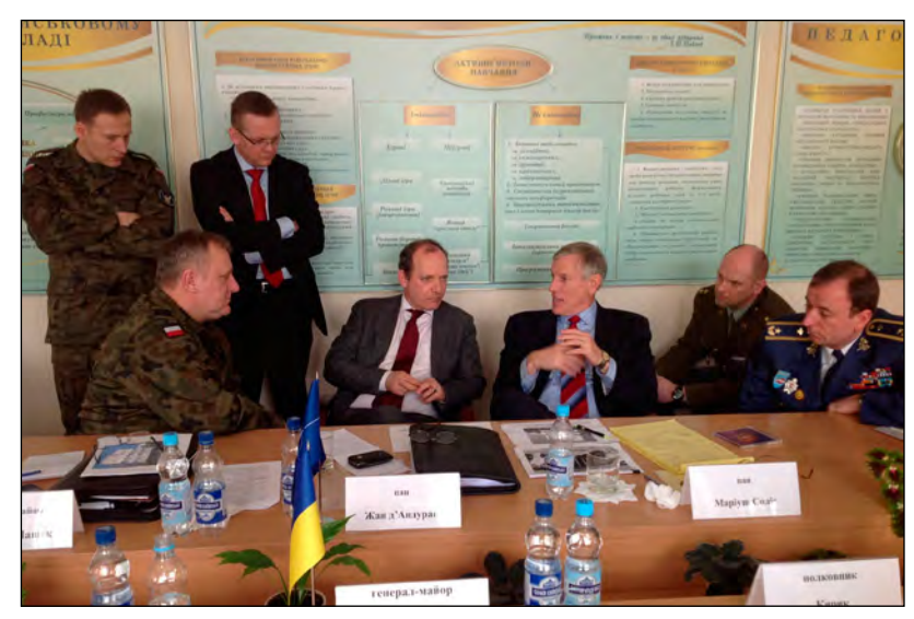
Defence Education and Enhancement Programme (DEEP) Team first visit to Ukraine with Czech, Polish, Slovak, US and NATO experts.