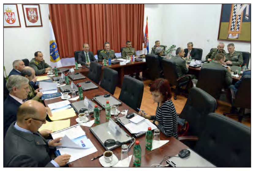
Defence Education and Enhancement Programme (DEEP) Team first visit to Serbia with Austrian, Czech, Romanian, US and NATO experts.