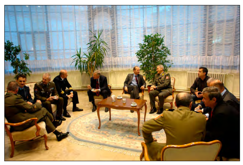
Defence Education and Enhancement Programme (DEEP) Team first visit to Serbia lively discussions between NCOs, officers and civilians lead to many agreements.